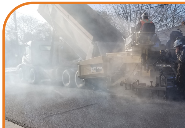
Paving after pipe work is done & remediation work is underway. Project is nearly complete. (Photo from a similar project.)