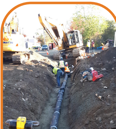
Pipe work on a street similar to this project. (Photo from a similar project.)