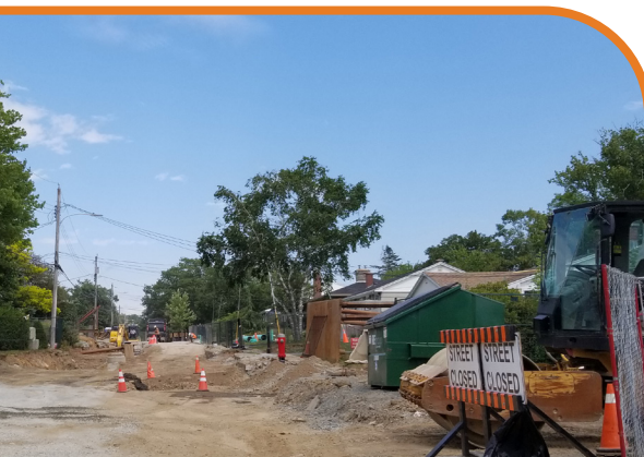
Street during integrated work involving pipe work, new paving and curb. (Photo from a similar project.)

The session will not have a formal presentation, but there will be display boards and staff on hand to answer questions. Anyone can drop in at any time during the session.