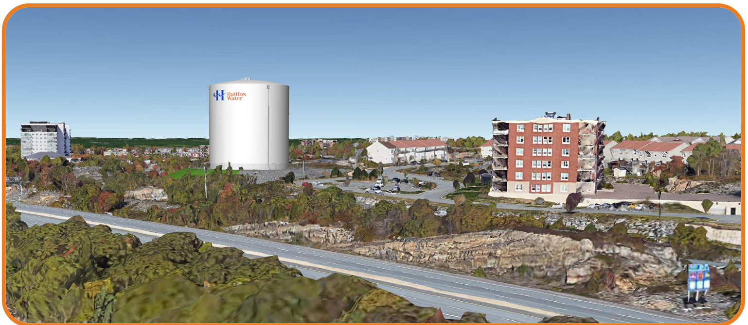
Project Rendering South Elevation - Looking North