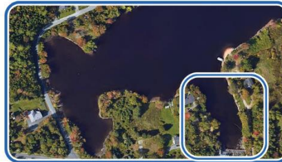
This image shows the general Lake Major area. The small box shows where the Lake Major Dam Replacement Project is taking place in relation to the communities in and surrounding the Lake Major area.

This image shows the area of Lake Major in the immediate vicinity of the project, and the existing dam in the bottom right corner, adjacent to the bridge.